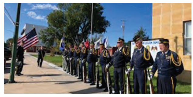
Chadron Post 12 members participated in the Honor Flight and send off.