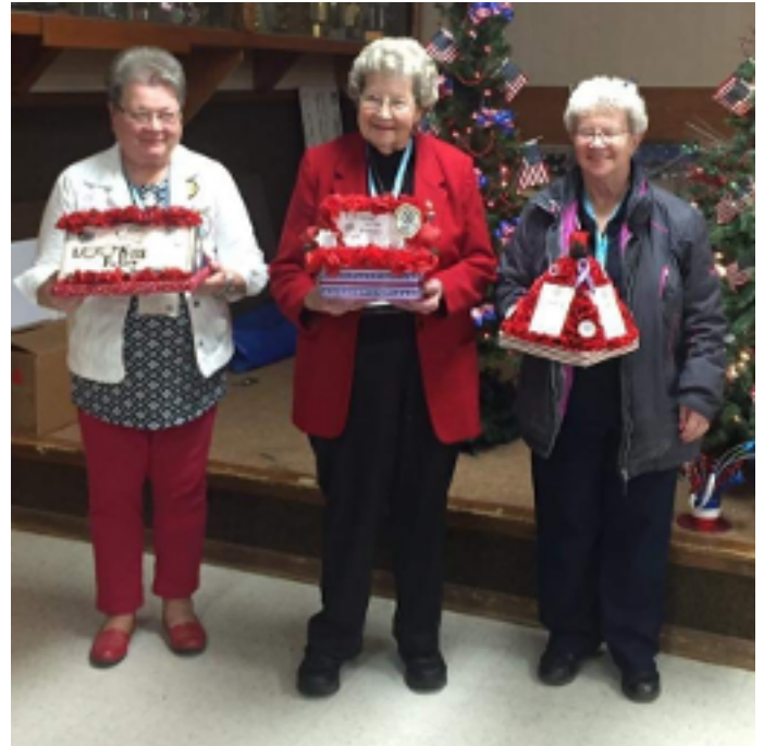
Top 3 Poppy Centerpiece Winners!